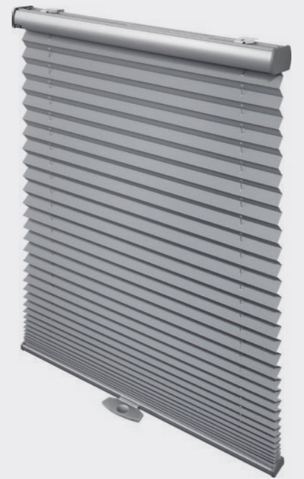
Free-hanging pleated blinds LiteRise with EOS handle