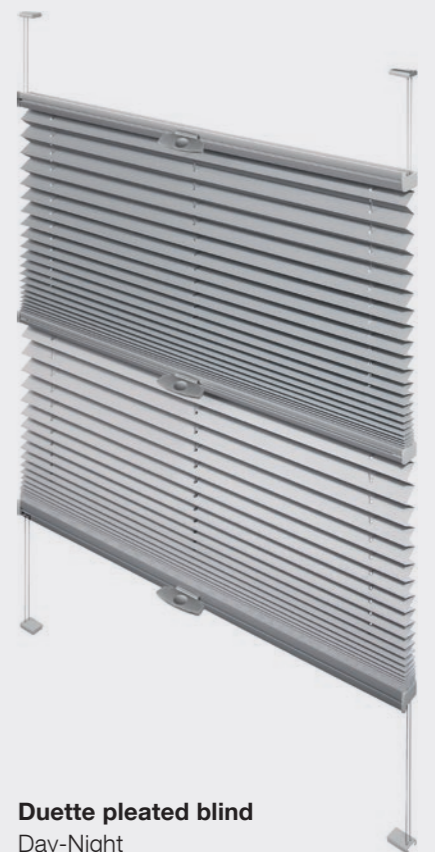
Duette pleated blind Day-Night