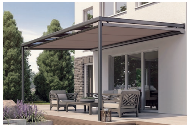
Overglass and underglass awnings