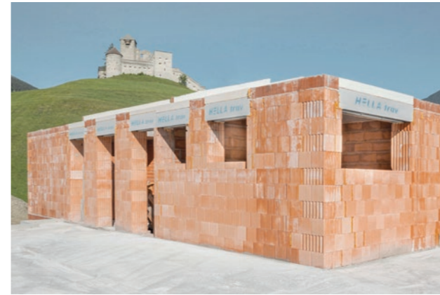
Solutions for building shells